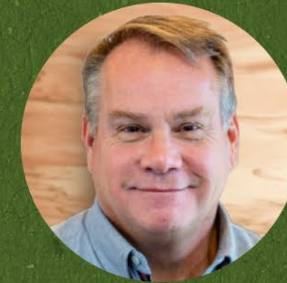
HAL KING, PH.D.

Former Under Secretary for Food Safety, U.S. Department of Agriculture